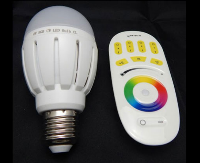
Syncing the RF Remote, or App via wifi bridge, to the LED bulbs

LED Bulb Installation • Take the led bulb out of the packaging, holding it only by the acrylic lens. • Switch off the power at the wall or lamp switch before installation. • Replace the original light bulb with the new WiFi LED Bulb. • Switch on the power, the led bulb will light under normal circumstances. • Sync a remote to the bulb as below and set to full brightness and colour. • If the bulb does not sync, then firstly clear the previous channel as per